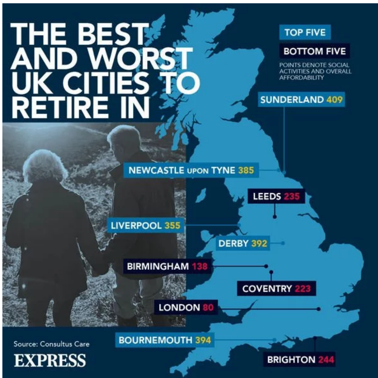
Best & worst places to retire UK (Image: Express)

Silver Voices has written to their 5000 members letting them know how their local MP voted on the triple lock.