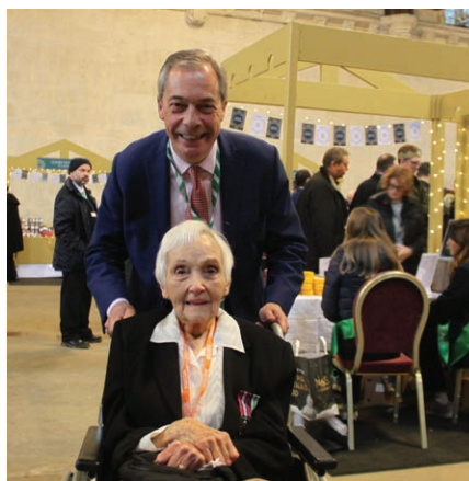
After the PMQs, Reform UK leader Nigel Farage agreed to support our campaign on social media.