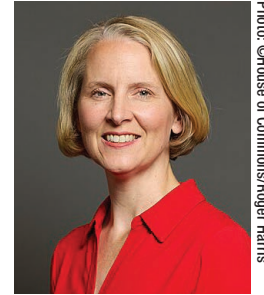
Minister Emma Reynolds

Despite this, we are hopeful the meeting marked the beginning of further ministerial-level conversations where we continue to engage and finally move the discussion forward. Our optimism is based on the fact that Ms Reynolds appeared surprised and sometimes shocked by some of the information we provided.