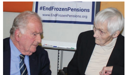
MP Sir Roger Gale heads up the All-Party Parliamentary Group on Frozen Pensions.