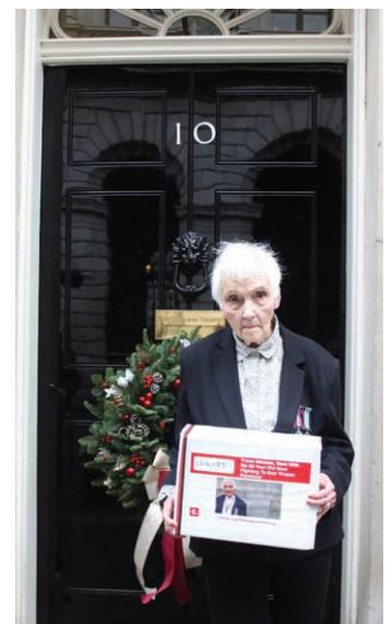
Delivering her 143,000-strong petition to #10.

Our thanks to all CABP members who signed the petition.