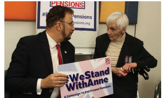
MP Afzal Khan is a member of the Frozen Pensions parliamentary group.